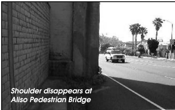
Shoulder disappears at Aliso Pedestrian Bridge

Hardly anyone feels safe riding a bike or walking on the Coast Highway. Motorized metal roars past in tons as we prayerfully occupy non-existent bike lanes or the space between two disconnected stretches of sidewalk. Do it at night? Surreal. We often choose our cars even for short trips and sacrifice the exercise and pleasure of walking or biking. What happens to people who don't drive — those too young, too old, disabled, don't have the money, or don't want a car?